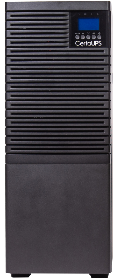
*Image shows 10kVA C650-B model